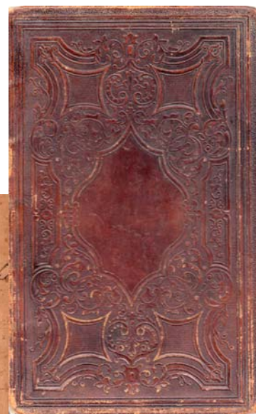
The beautifully embossed leather cover of the McGuire Bible