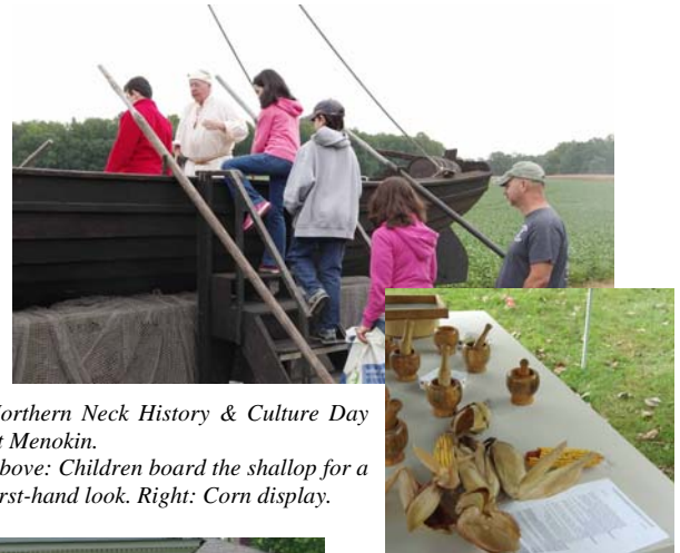
Northern Neck History & Culture Day at Menokin. Above: Children board the shallow for a first-hand look. Right: Corn display.